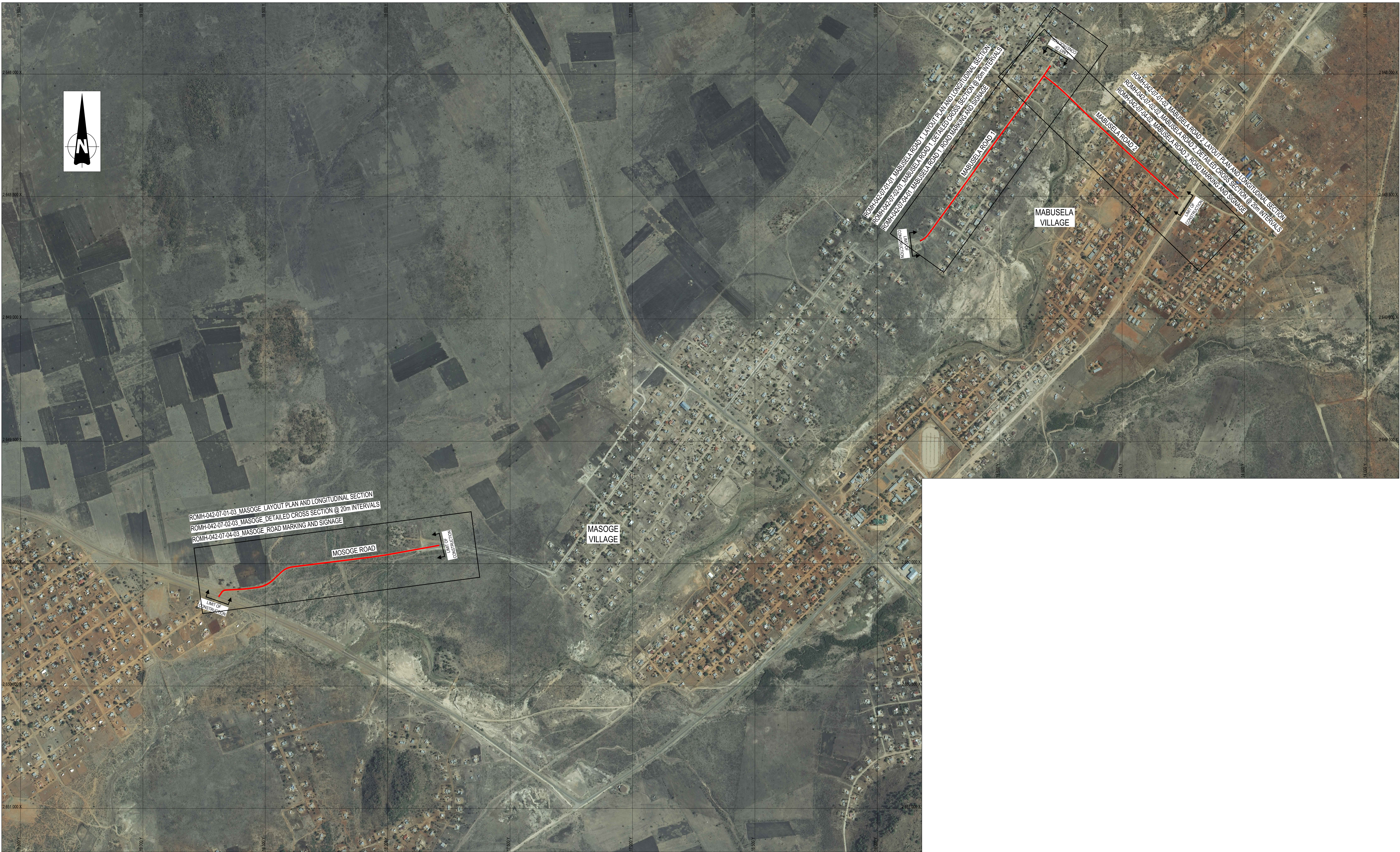
MABUSELA AND MASOGE VILLAGES KEY PLAN SCALE 1:5000